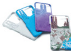
Data courtesy of FreshFiber